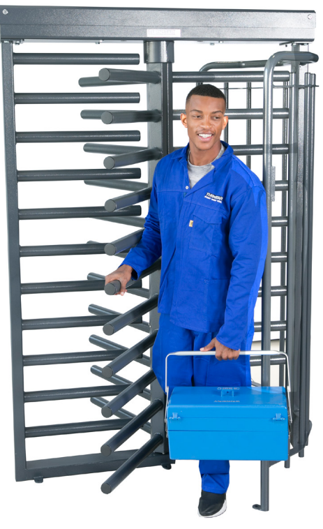
TITAN FLAT PACK VERSION (FOR LOW COST SHIPPING)